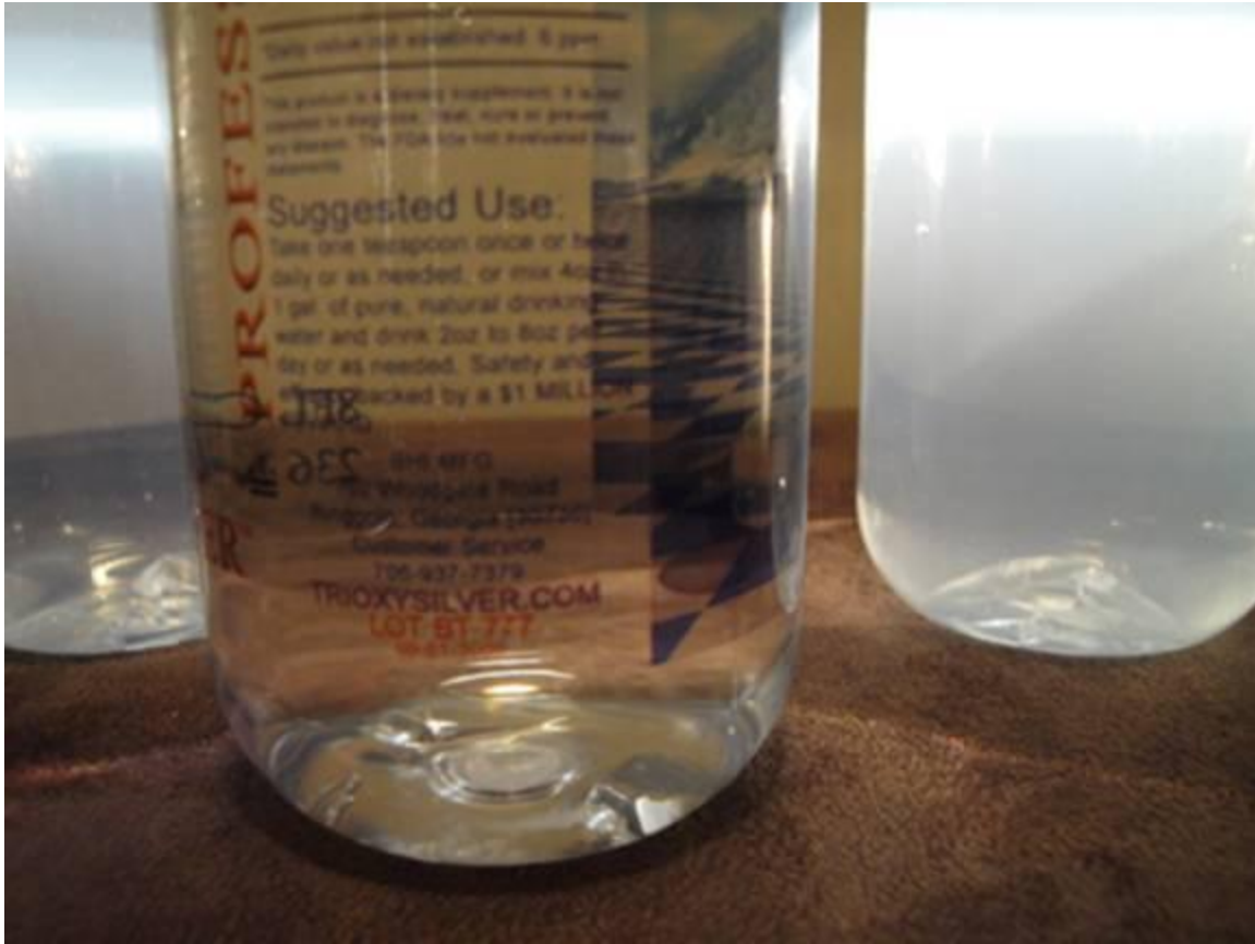
Sovereign Silver 10PPM on left; Trioxy Silver 6PPM Bionaid™ Trioxy Silver™ Professional on right; Picture of Bionaid™ Trioxy Silver™ Professional Lot Number tested at center.

As a side note, we would like for you to notice that Bionaid™ Trioxy Silver™ Professional is in a clear bottle as a finished product. This is because we want to make the point that Bionaid™ Trioxy Silver™ Professional is not adversely affected by sunlight. All of the other silver products we have seen on the market have been bottled in a tinted bottle to protect it from the sunlight because sunlight will cause the suspended silver to fall out of suspension and change color.